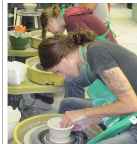
Corcoran alumni, students and teachers prepare pottery for Empty Bowls.

In November, students, faculty, and alumni from the Corcoran College of Art and Design hosted a two-day "Bowl-a-Thon" to create hand-made bowls for SOME's annual Empty Bowls fundraising events.