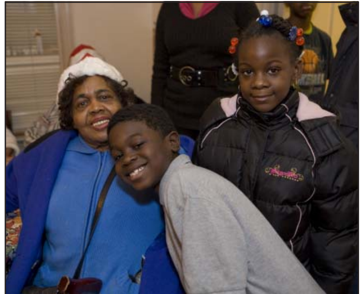
A senior at SOME's Dwelling Place shelter is flanked by two young residents of Thea Bowman House at a joint holiday party. With your support, SOME was able to provide hot meals and holiday cheer to homeless and hungry men, women and children in our community.

April 11, 2010 at 5:30 pm Complete details on page 3