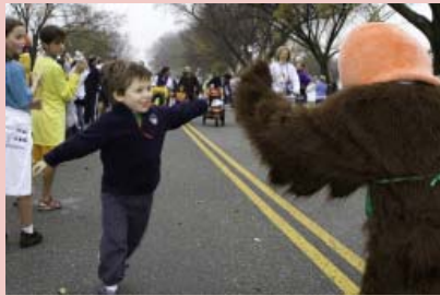
The Trot for Hunger featured a Little Turkey Fun Run for children at 8:00 am.

Thanks to everyone who took part and helped to raise more than $200,000 to provide meals, clothing, health care and comprehensive services to the District's homeless.